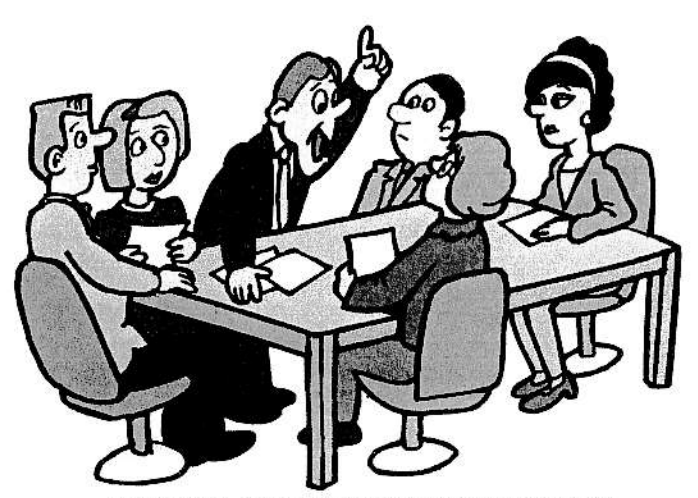
QUARTERLY BUSINESS MEETING SUNDAY, JANUARY 23rd at 6PM

We will be packing up the Christmas decorations on Saturday, January 8th...(the day after the Greek Orthodox Church celebrates the wisemen coming to bring Jesus their gifts). The more people that can help, the merrier. Just meet us in the sanctuary at 10AM so we can pack up all the decorations for next year. Thanks!