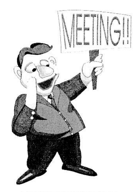
DEACON'S MEETING MONDAY, FEBRUARY 7<sup>TH</sup> AT 7pm.

Our next quarterly business meeting will be Sunday, January 23<sup>rd</sup> at 6PM. We hope to see you there!