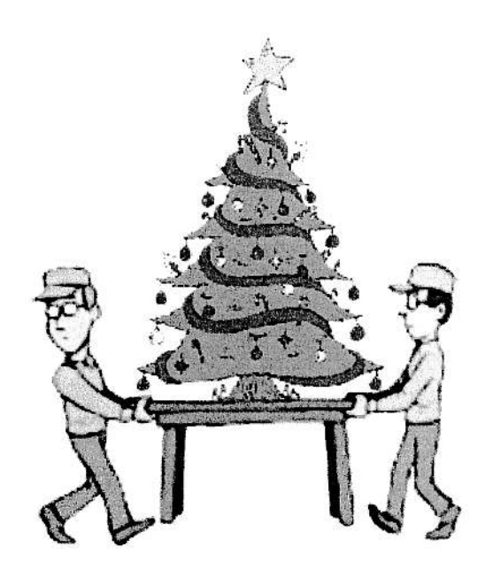
PACKING UP THE CHRISTMAS DECORATIONS SATURDAY, JANUARY 8<sup>TH</sup> FROM 10am - NOON

We will be packing up the Christmas decorations on Saturday, January 8th...(the day after the Greek Orthodox Church celebrates the wisemen coming to bring Jesus their gifts). The more people that can help, the merrier. Just meet us in the sanctuary at 10AM so we can pack up all the decorations for next year. Thanks!